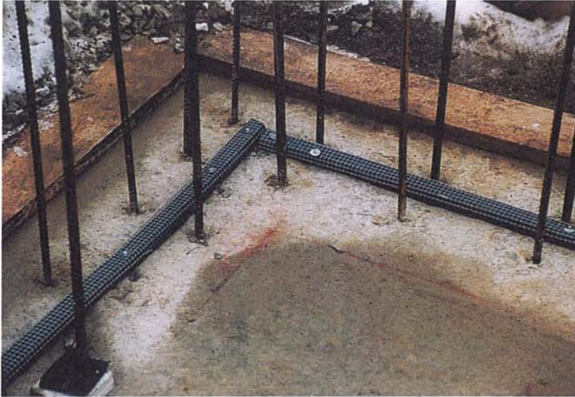
Example for installation with grid and nails