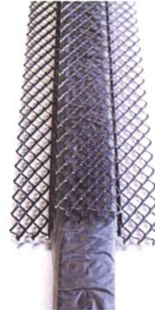
MASTERSTOP bentonite swelling tape xx/xx black and green MASTERSTOP LONG TIME with grid for fixing